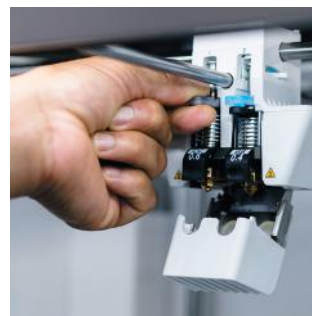
Print core CC 0.6 mm Ruby-tipped for printing abrasive composites