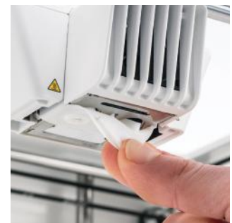
Nozzle covers x10 Replacement covers keep your print head in top condition