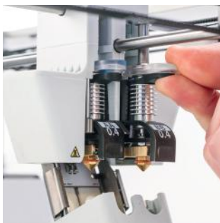
Print core AA 0.25, 0.4, 0.8 mm Quick-swap nozzles minimize downtime